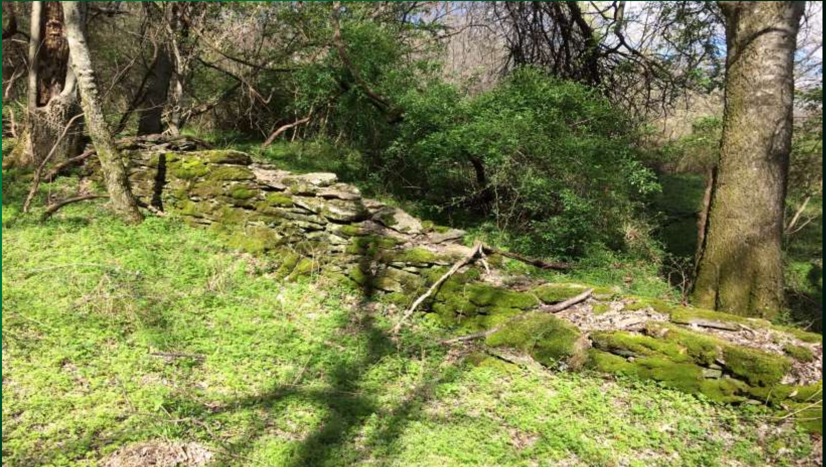
Trail 2, historic stone wall