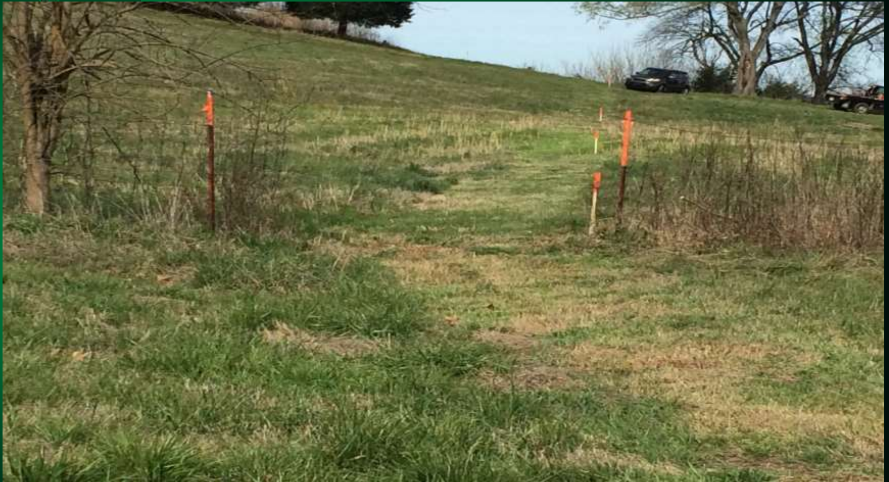
Trail 1, Marked route through fence