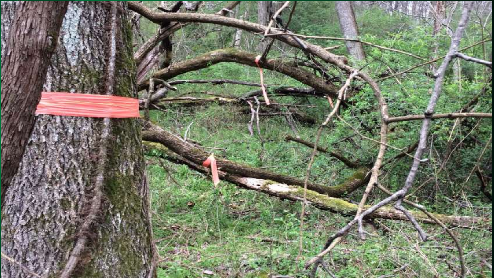
Trail 2, marked route through fallen Bowdock Tree