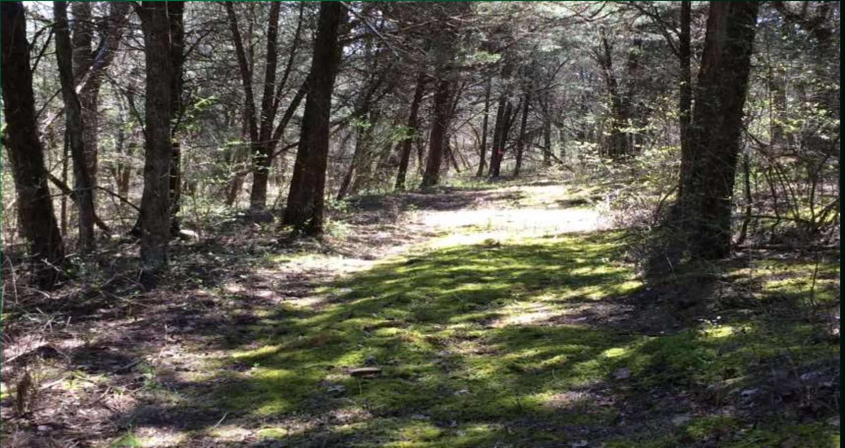
Trail 2, Marked route on old farm road