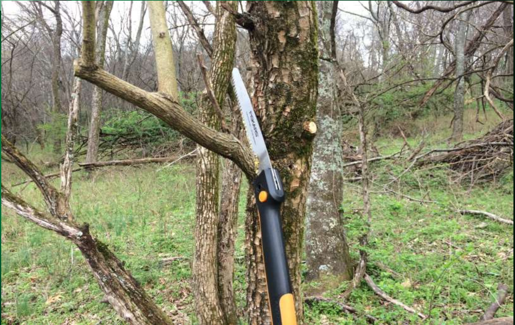
Trail 2, Proper limb pruning technique