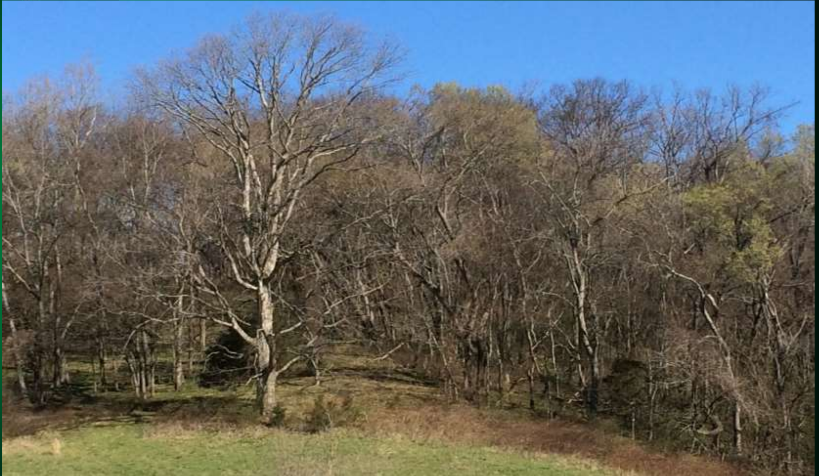
Trail 2, Signature White Oak