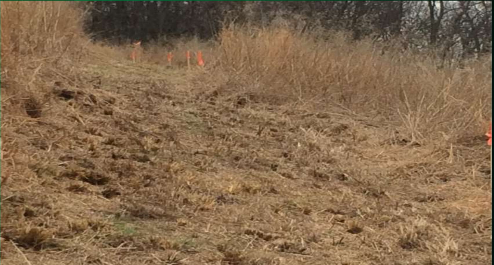
Trail 1, Marked route down from Bald Knob