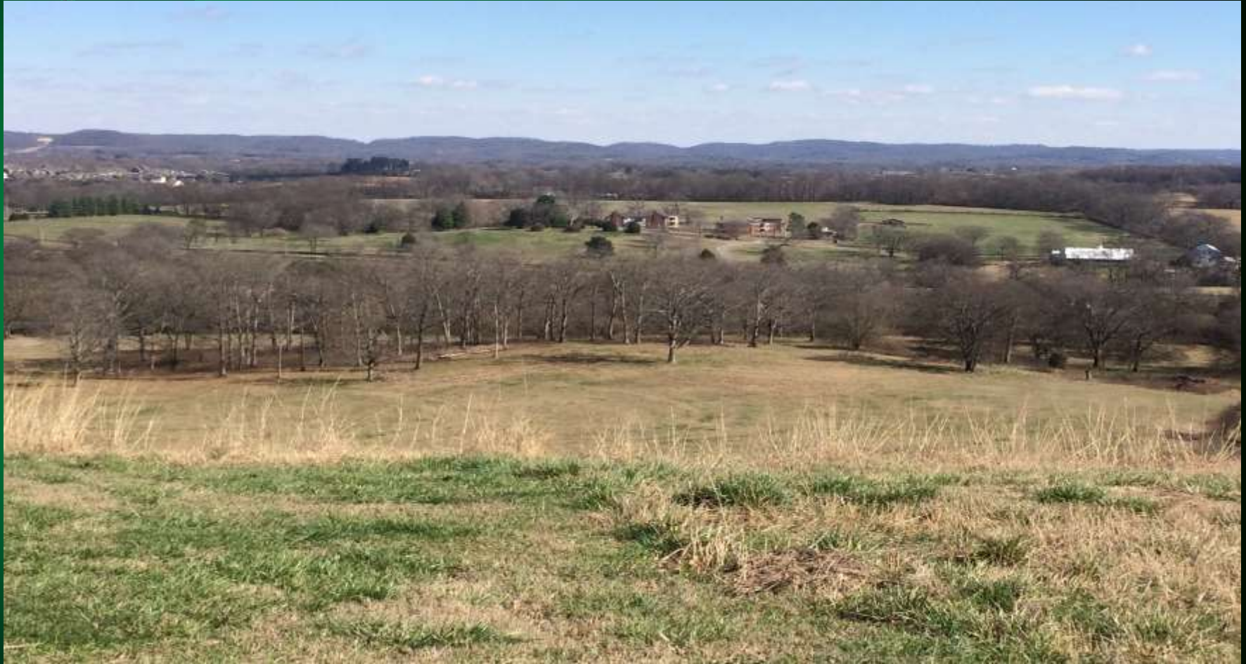
Trail 1, Bald Knob, East View