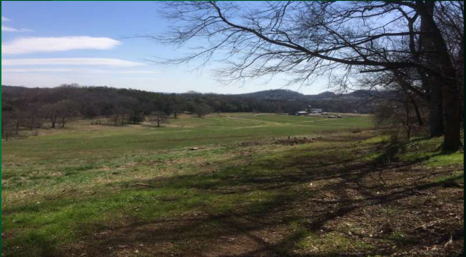
Trail 1, View of old farm road