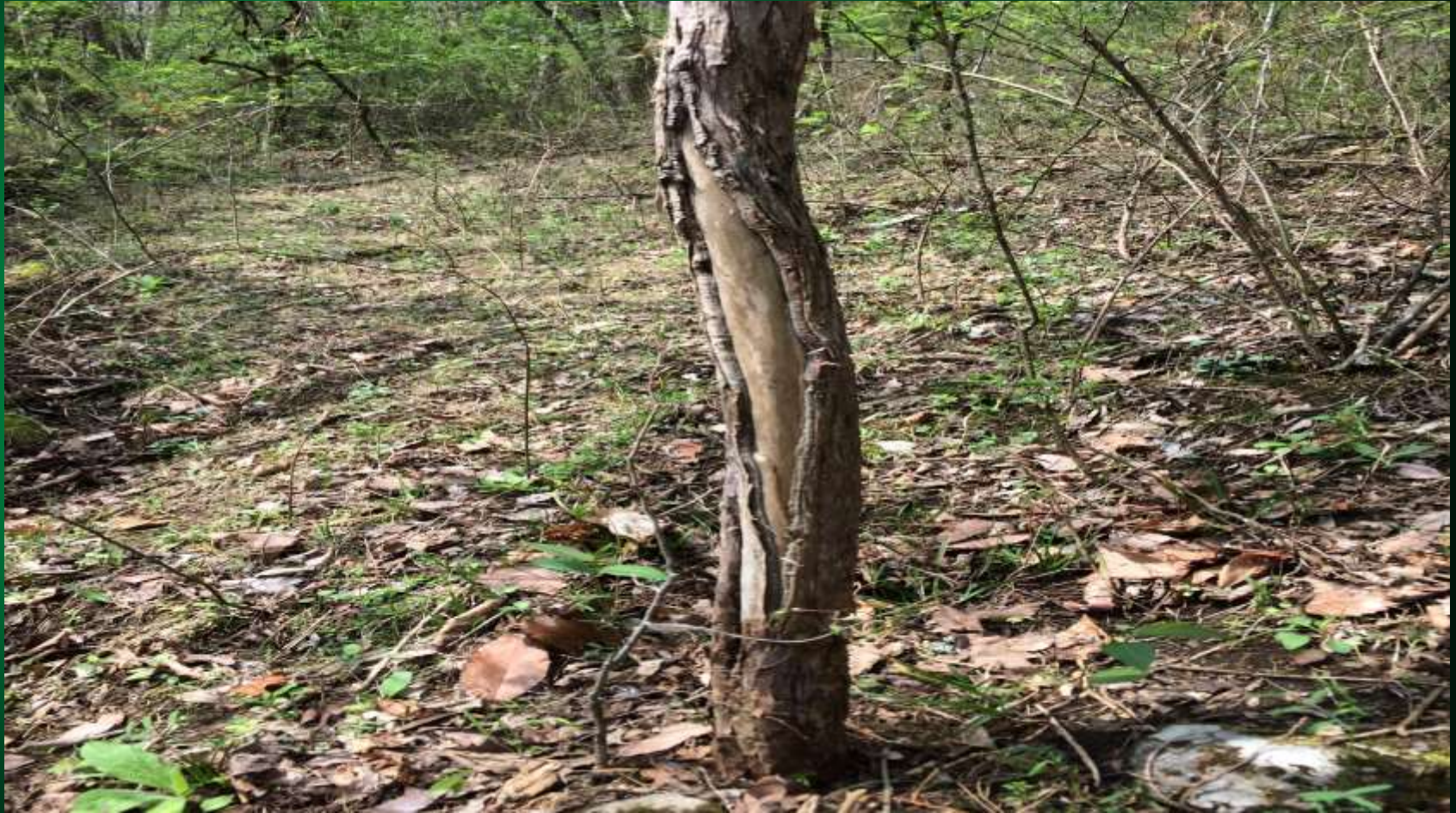
Trail 2, Buck rubbed antlers on small tree