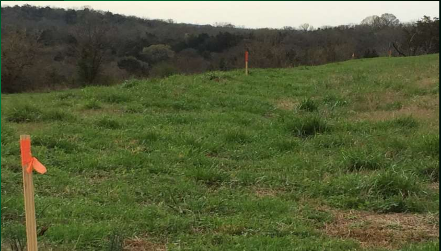
Trail 1, Marked route on farm terrace