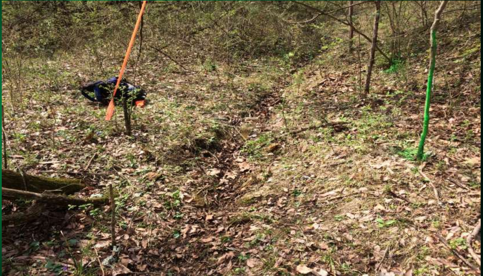
Trail 2, Marked route over stream