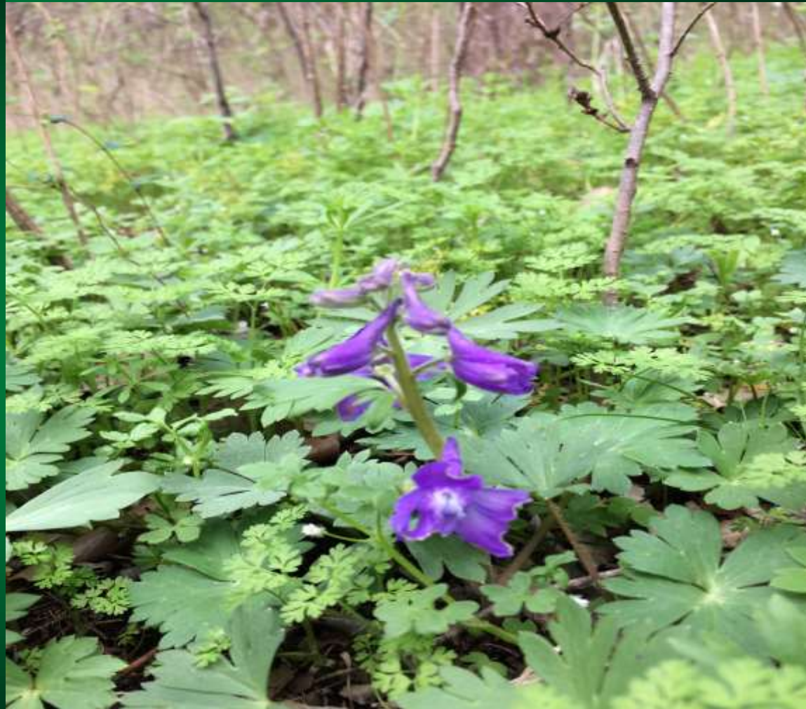
Trail 2, Spring Wildflower