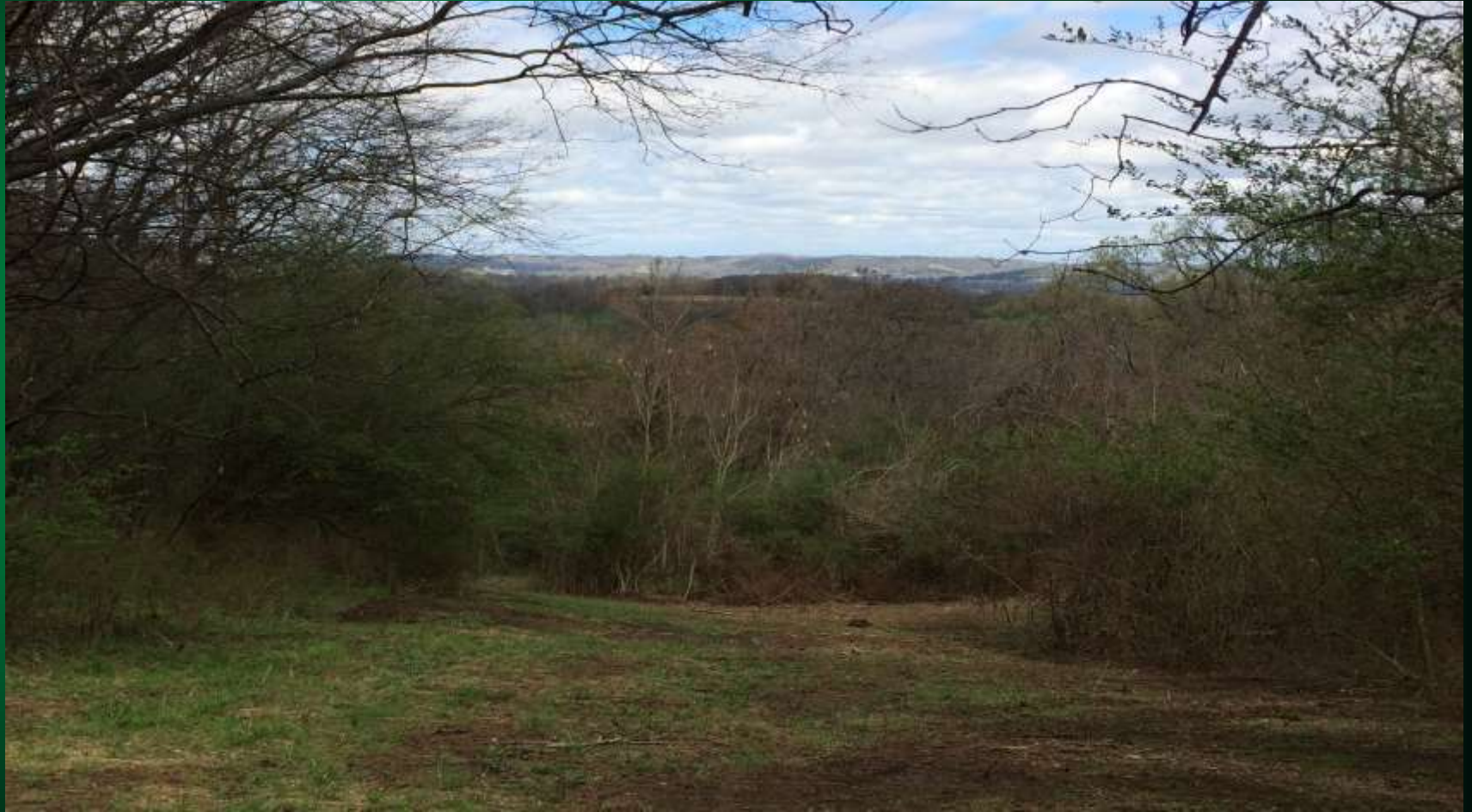
Trail 2, View to Northeast