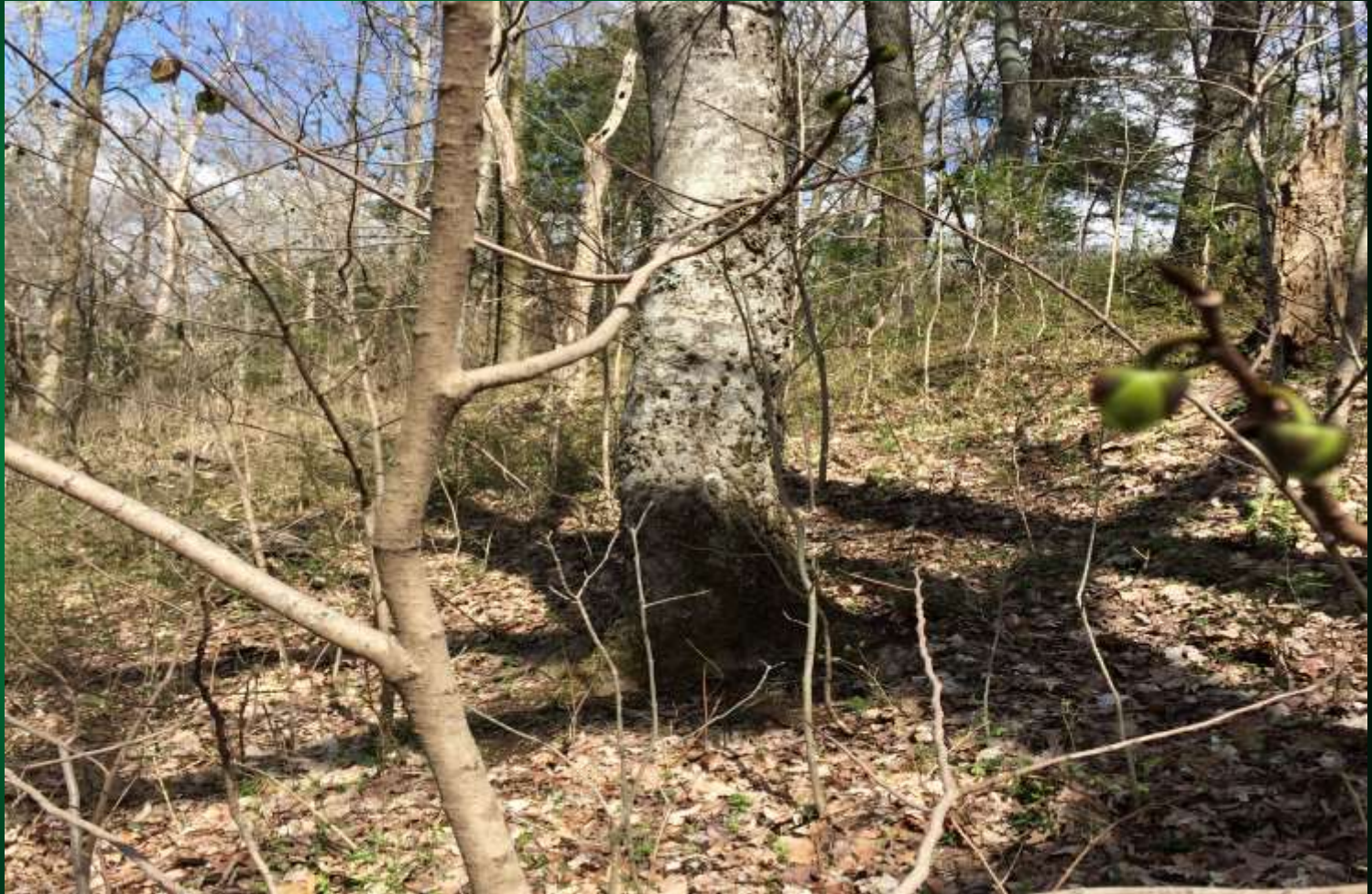
Trail 2, Pawpaw tree bloom