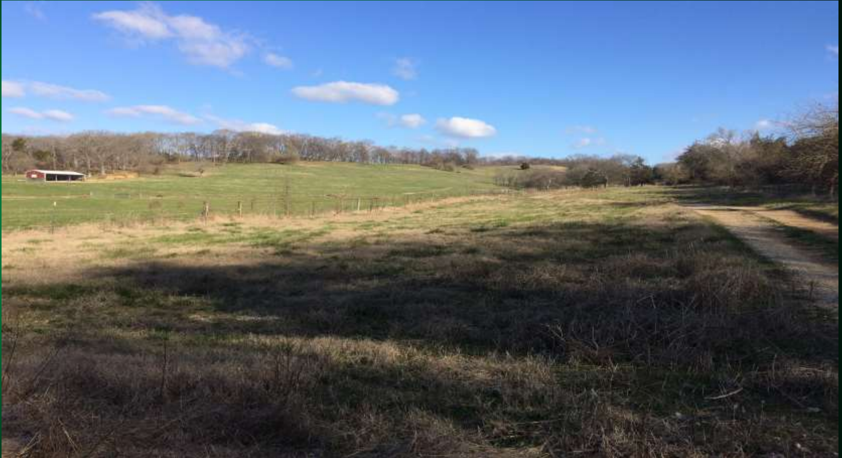
View from Southeast corner of the park