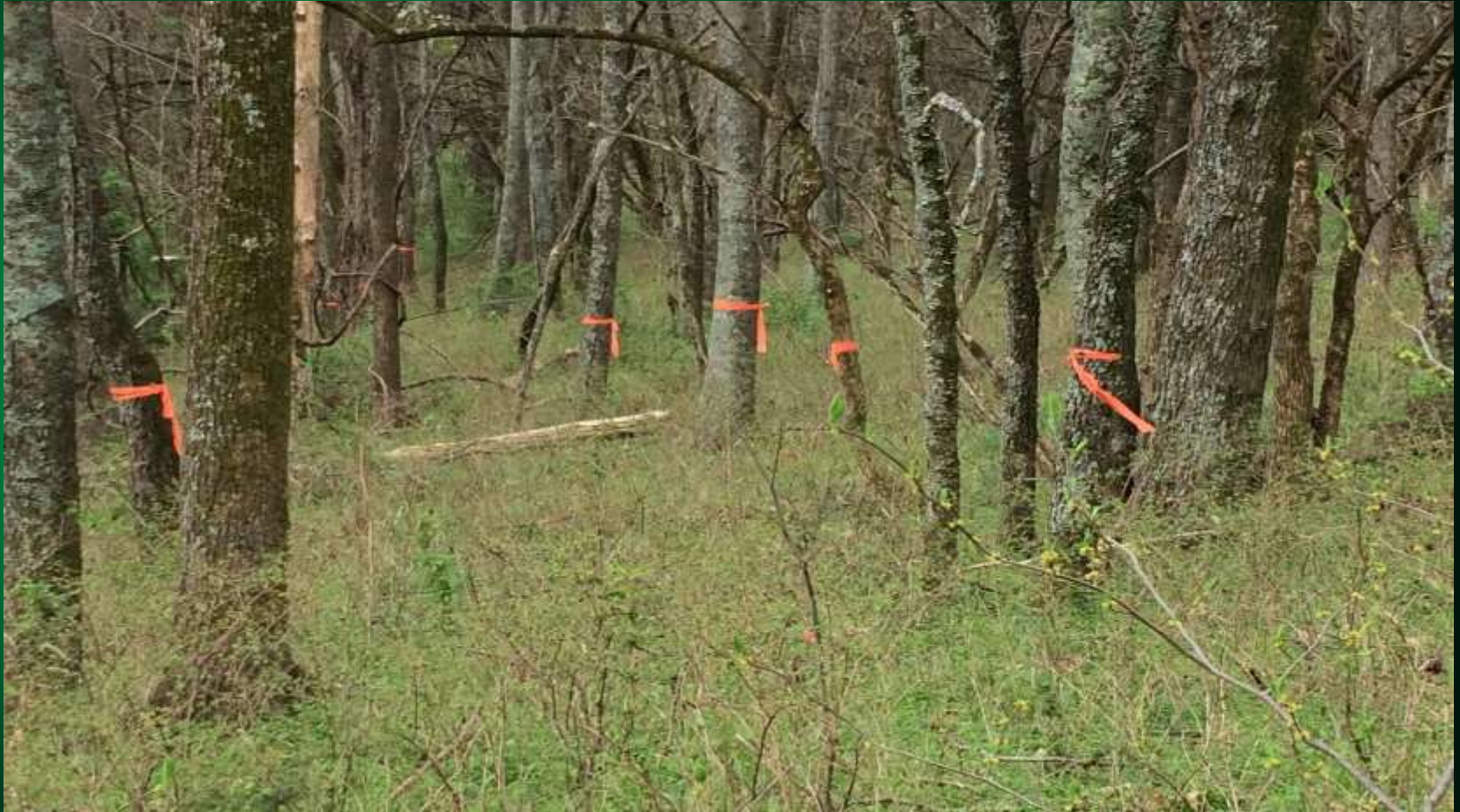
Trail 2, Marked route through open woods