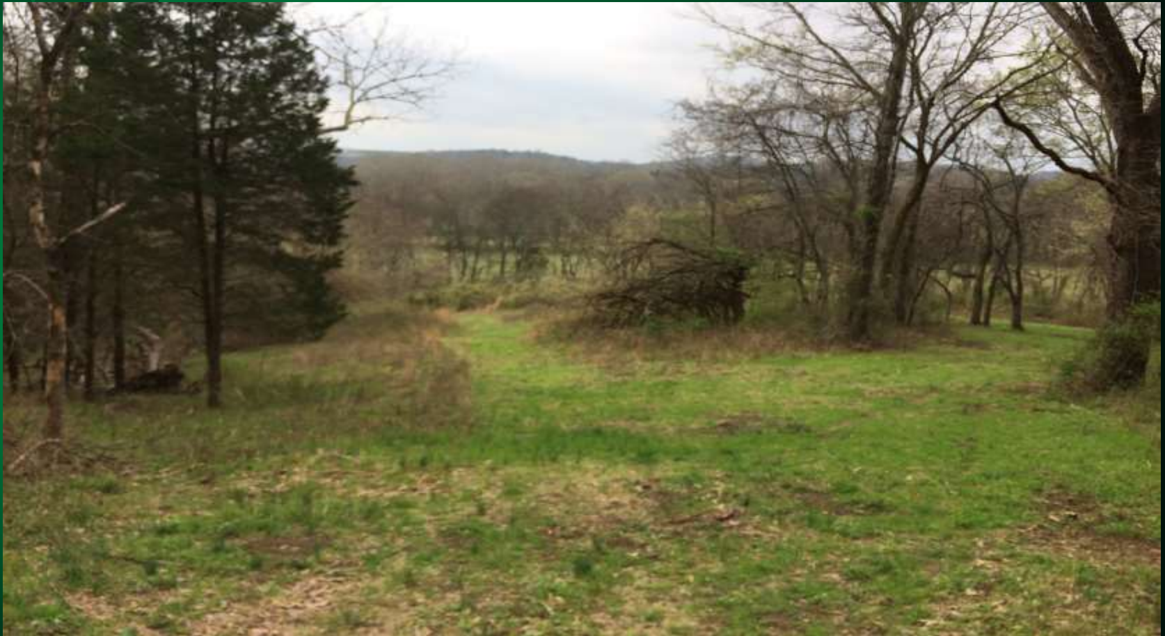
Trail 2, East view of the park