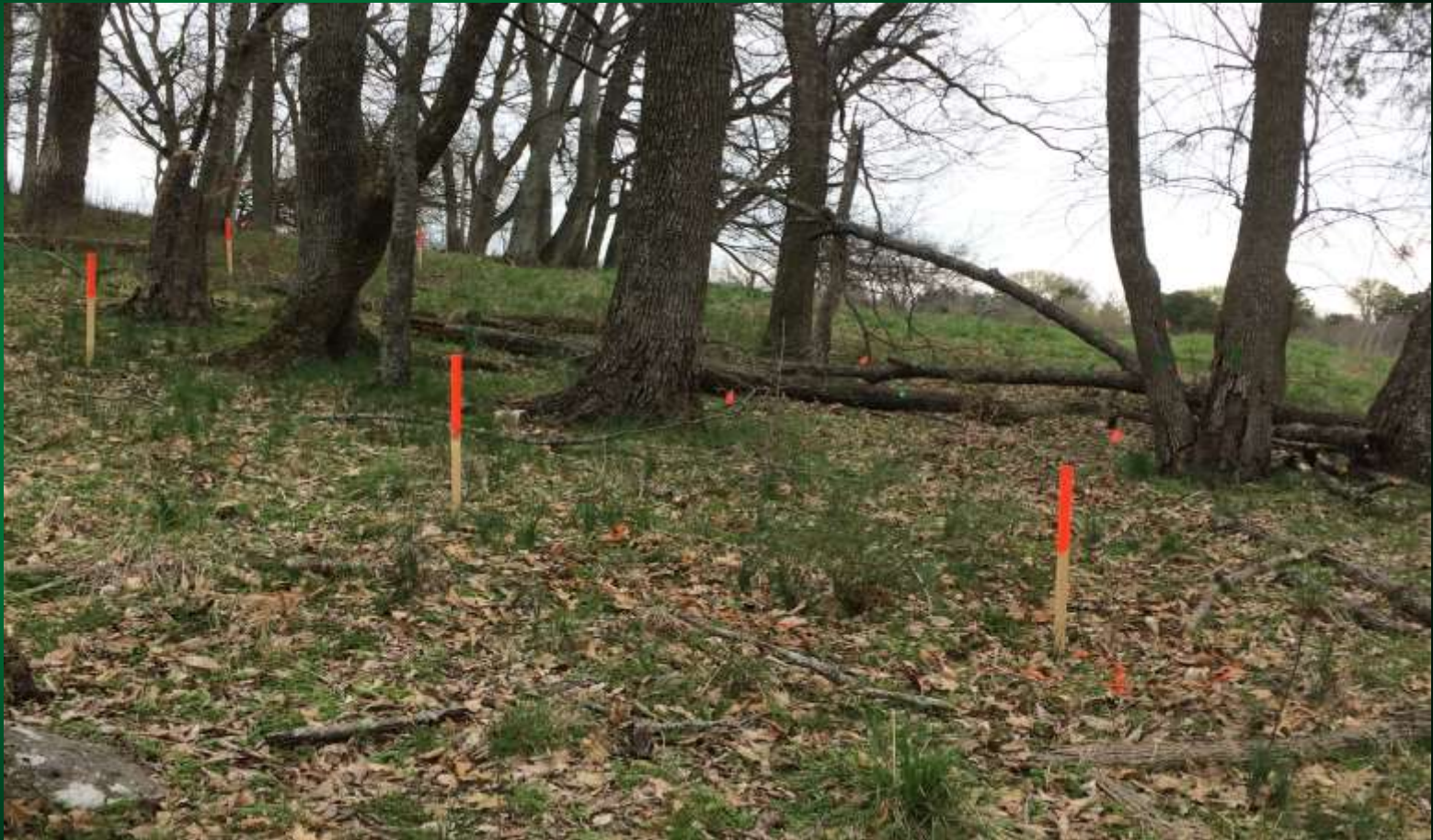
Trail 1, Loop Junction