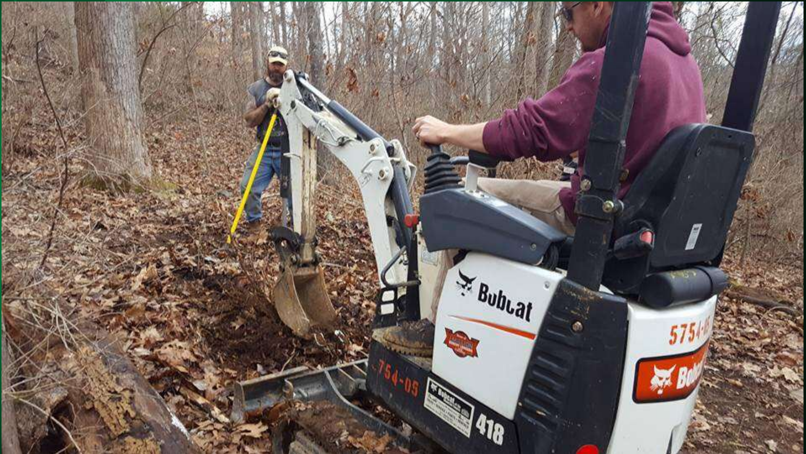
1 Ton Mini Excavator for trail building